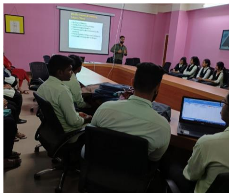
The Farewell meeting for the outgoing batch has been convened on 27 th June 2023

An Awareness program on Masters in Pharmaceutical Chemistry: Course details & its scope was organized in association with Department of Applied Chemistry & Basic Science, SBS University, Dehradun on 5 th April 2023.